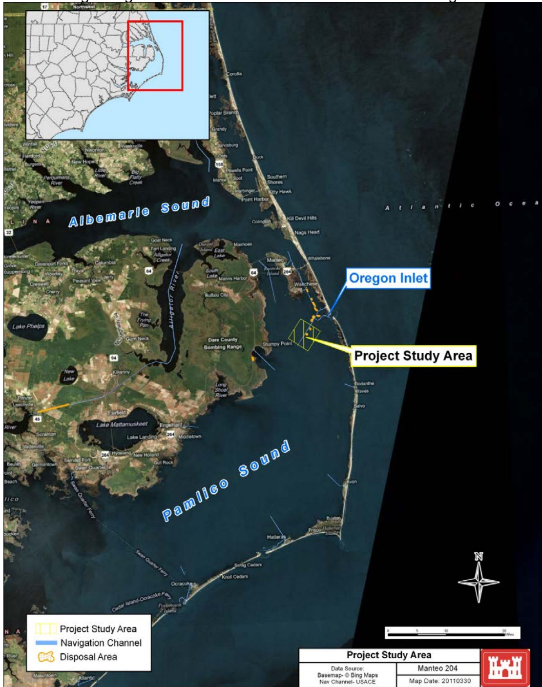
Figure 1. Map of Project Location

Study Description. This appendix presents the results of the engineering evaluations supporting studies aimed at creating a man-made submerged oyster reef habitat. The study involved evaluation of the feasibility of creating submerged oyster reef habitat using dredged material and alternatives to contain the dredged material.